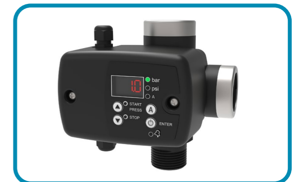
Mini Fix VF Controller