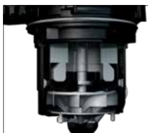
PERFORMANT AND SILENT MOTOR