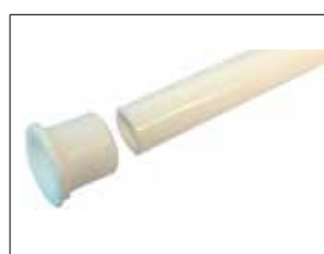
ADAPTING FLEXIBLE HOSE